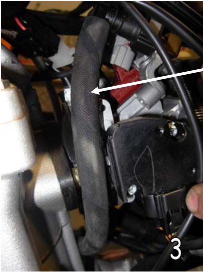
Fuel Line 610 only