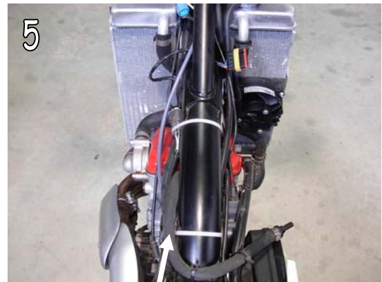
Fuel Line 630 only